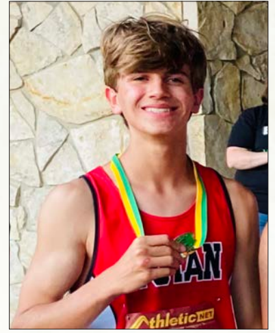
Track award winner