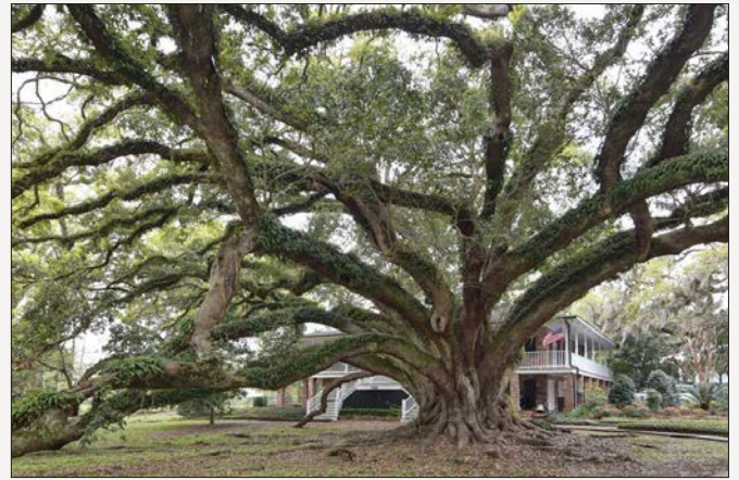
The largest Oak Tree in the United States (currently) is called the Seven Sisters Oak Tree. Foresters estimate it to be about 1200 years old!

WISHING YOU A Merry Christmas AND A HAPPY NEW YEAR