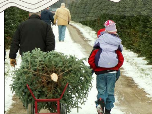
USDA Christmas Tree Permits. Story on page 3.