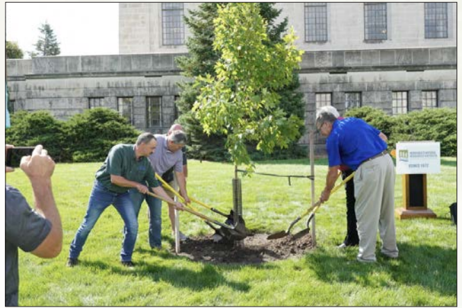
A ceremonial 100 millionth tree was planted Friday on the grounds of the Nebraska State Capitol to commemorate the work of the state’s Natural Resources Districts to get trees and shrubs planted for wildlife habitat and erosion control.

The trees and shrubs are sold in bundles — the NRDs take orders between November and March, then distribute the trees and shrubs in April in time for planting.