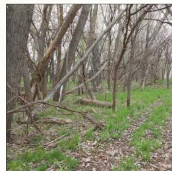
May 13, 2021