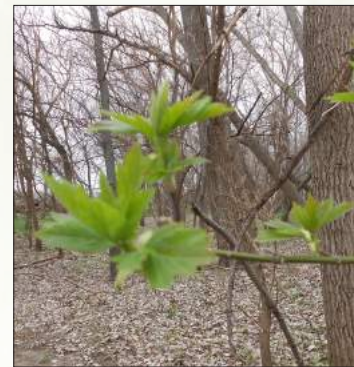
April 13, 2021

Pine, Ponderosa Hackberry Oak, Bur Elm, American Eastern Redcedar Cottonwood Ash, Green Elm, Siberian Honeylocust Maple, Boxelder Mulberry Linden Walnut Birch, River Aspen, Quaking Russian-olive Willow, Black