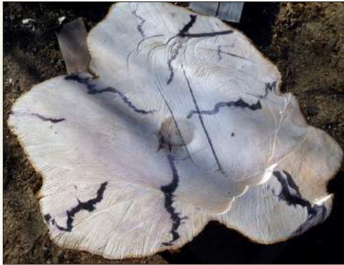
Stump-cut about 4 inches below injection holes

I have been injecting trees for over 50 years, first with fungicides for Dutch elm disease and iron for Pin Oak chlorosis. In 2010 I started injecting dye into living trees. At the EAB injection workshops in Omaha, 2016, and in Lincoln, 2017, we peeled a strip of bark off a live tree and put dye in so that all could watch the dye move up the tree. The dye movement was very rapid.