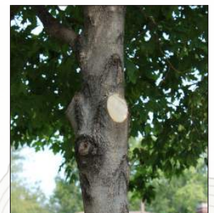
A tree developing wound wood.

When a tree is wounded, such as with pruning, it sends defense chemicals to the wound to seal it off. Then, during the growing season, the tree develops wound wood to close the wound. Research has shown that any type of tree wound dressing interferes with a tree's natural defense mechanisms and the sealing process. Wound dressings also trap moisture, promote decay, and prevent wound wood from forming.