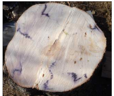
Cross section about 10 inches above drill holes

The larger zigzags are due to changes in the spiral twist of the vessels/fibers in a given year. I do not know what causes this change in the wood growth pattern.