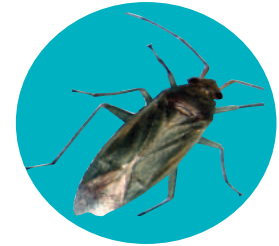
Honeylocust Plant Bug

TreeMec Inject can be used as formulated or diluted with water (low, medium, medium-high and high rates).