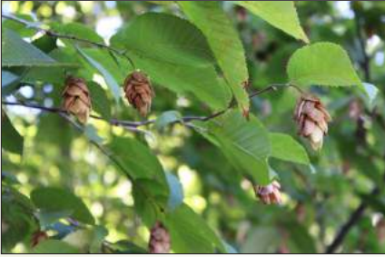
These capsules contain small nuts.

By: Jim Keepers, Finders Keepers Landscaping, NE Certified Arborist