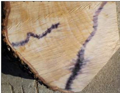
Zig-Zag dye pattern

The wood of deciduous trees is characterized as either diffuse-pours or ring-pours. Maples are diffuse-pours. Diffuse-pours species move more water in older annual rings than due ring-pours species. This is why you can see dye movement near the center of the trunk at the stump cut. Notice that there is little dye near the center 10 inches above the injection holes, except for intermittent spots along with one injection site.